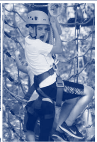
Fifth and sixth graders at Walled Lake Nature Camp.